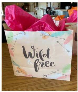
Ladies Gift Bags