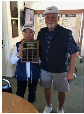
Plaque Awarded to RHWGA